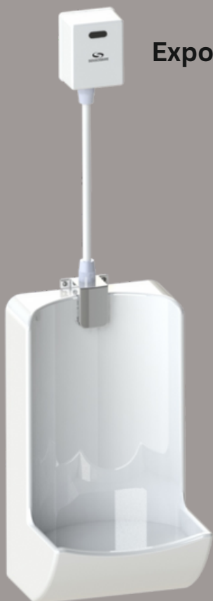
Exposable Sensor Urinal Unit