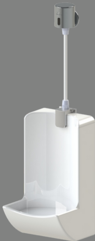
Exposable Sensor Urinal Unit